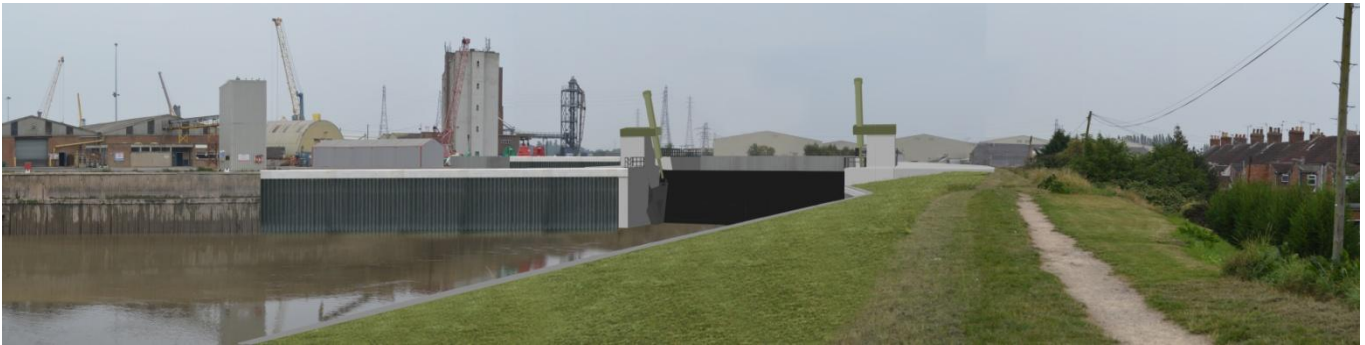
Image: Artist's impression of the barrier on the Haven looking downstream past the Port of Boston