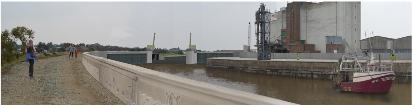
Image: Artist's impression of the barrier in the distance looking upstream past new flood walls on the Haven