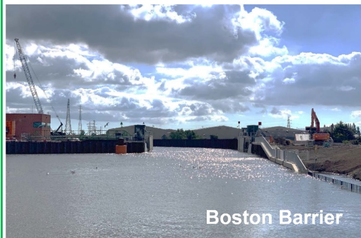
Top: Before works (2017), Middle: During barrier delivery (2019), Bottom: Barrier open (2020)

The Boston Barrier primary gate is now fully operational and working to give an enhanced level of flood protection to over 13,000 homes and businesses in the town.