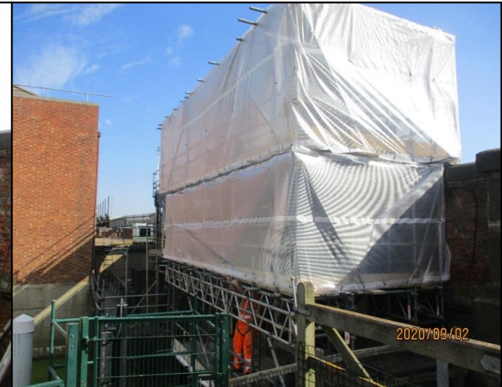
Construction of scaffolding across the site