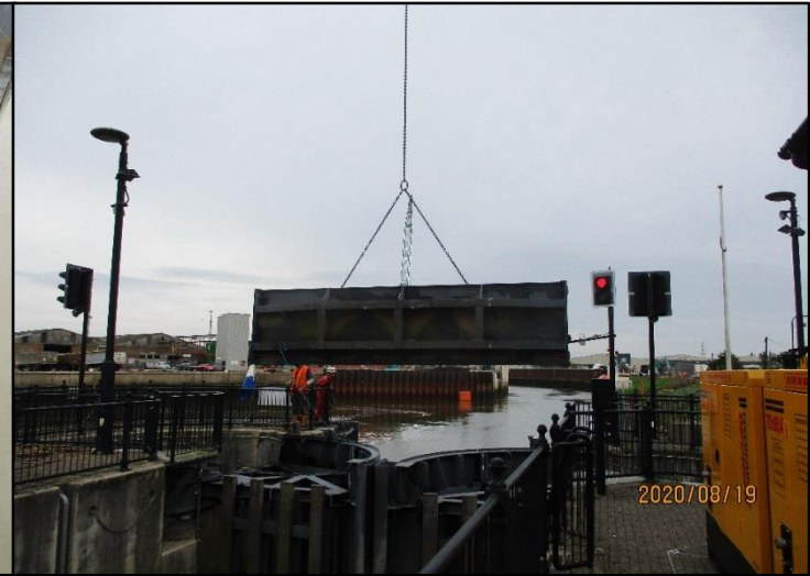
Installation of downstream stop logs