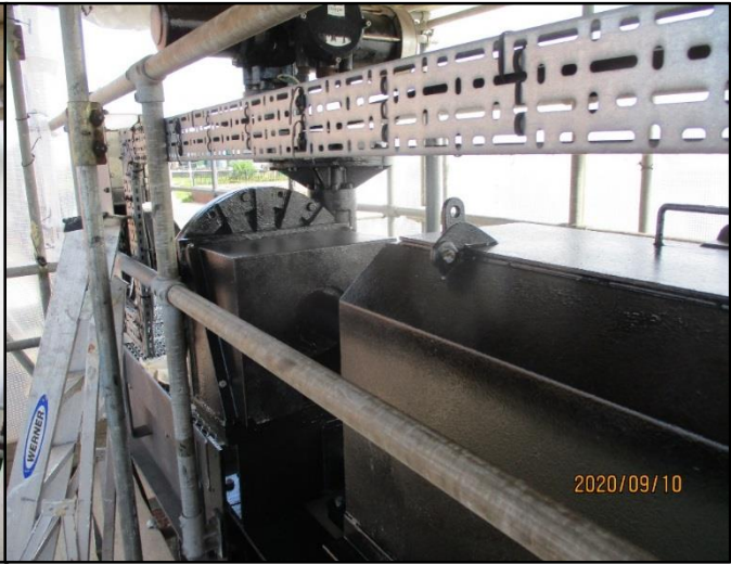
Cleaning and re-painting of asset